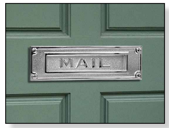
#4075 with chrome finish displayed