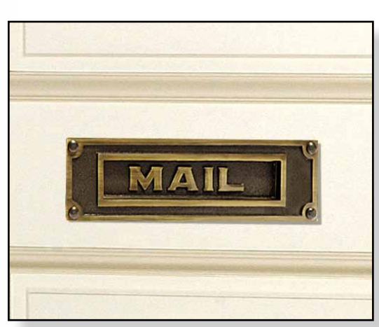
#4075 with antique finish displayed