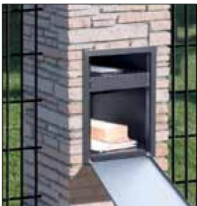
Rear view of (#4350) mounted in a column displayed

Made entirely of aluminum, Salsbury U.S.P.S. approved 4300 series mail chests feature both a front and rear access locking door. Mail is deposited through a non-locking access panel on the front. Each unit includes an outgoing mail tray, a lock with two (2) keys on each door (keyed alike) and an adjustable red signal flag. Units are available in a powder coated black, green, silver or white finish. Mail chests can be mounted on the optional bolt mounted (#4365) or in-ground mounted (#4385) aluminum pedestals or a base of your choice. Mail chests can also be mounted in columns, masonry or walls. Newspaper holders (#4315) and non-locking thumb latches (#4388) are available as options upon request. Mail chests are approved for U.S.P.S. curbside mail delivery. Master postal lock not required. For a smaller version of this product, see roadside mailboxes on pages 56-59.