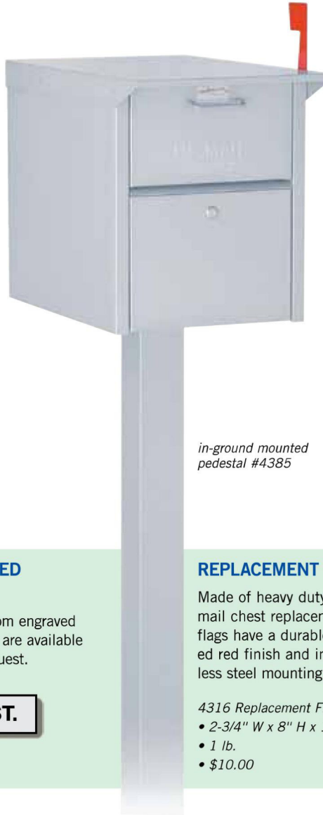
in-ground mounted pedestal #4385