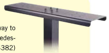
#4382 on a pedestal (#4365) displayed

Made of heavy duty aluminum, Salsbury spreaders are an ideal way to mount multiple mail chests to pedestals. Optional two (2) wide (#4382) and three (3) wide (#4383) spreaders easily attach to standard pedestals (#4365 and #4385).