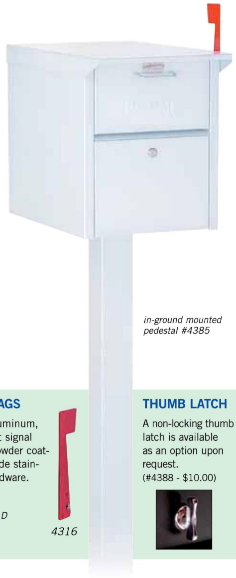
in-ground mounted pedestal #4385