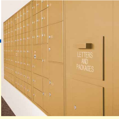
4B+ custom horizontal mailboxes with parcel lockers and collection unit in gold finish and regular custom engraving on collection unit (#3665) displayed.

<sup>4</sup> All front access collection units have an 18" W x 25-1/4" H x 12" D mail storage compartment. On rear access collection units, customer to supply mail receptacle.