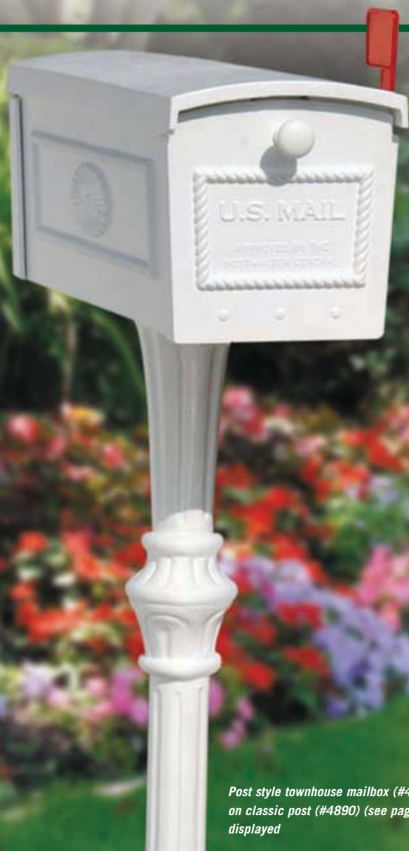
Post style townhouse mailbox (#4550) on classic post (#4890) (see page 53) displayed