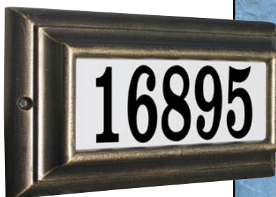
Standard (LTS-1300)* 13-1/2" x 7-1/2" x 2-1/2" (holds up to five 3" vinyl numbers)