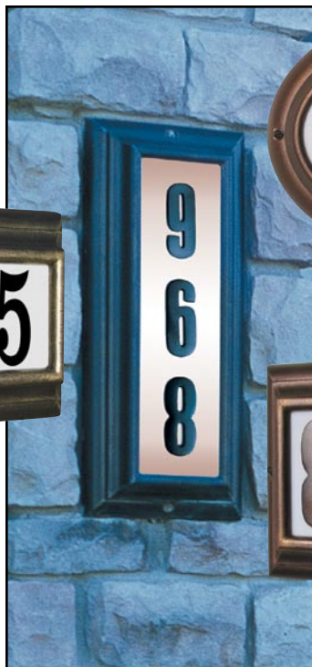
Vertical (LTV-1303) 7-3/4" x 17-1/2" x 2-1/2" (holds up to three 4" cast numbers or up to five vinyl numbers)