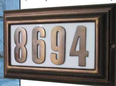
Large (LTL-1301) 13-3/4" x 8-7/8" x 2-1/2" (holds up to five 4" cast numbers)