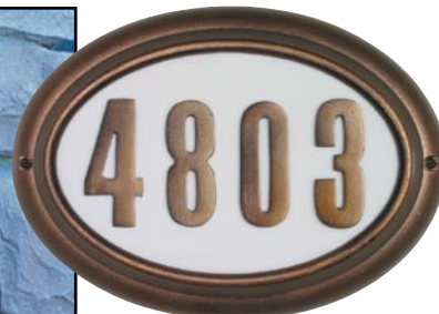
Oval (LTO-1302) 14-1/2" x 10-1/2" x 2" (holds up to five 4" cast numbers)